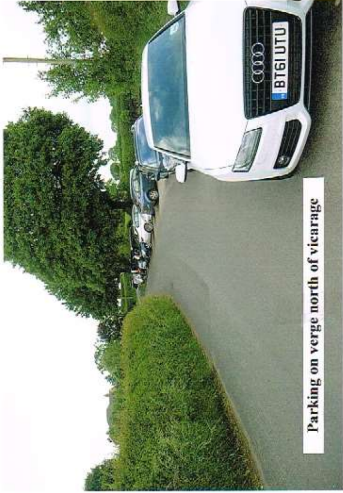
Parking on verge north of vicarage