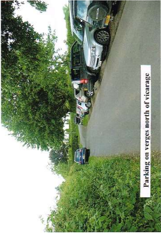
Parking on verges north of vicarage